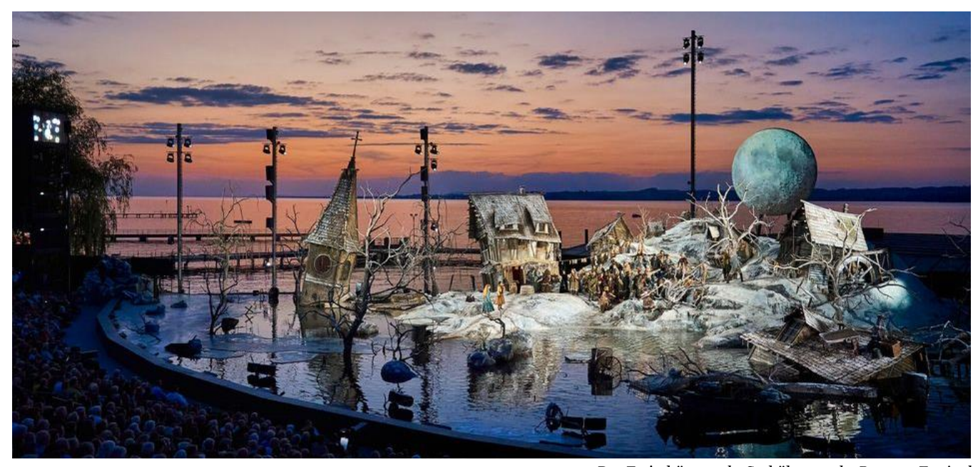
Der Freischütz on the Seebühne at the Bregenz Festival